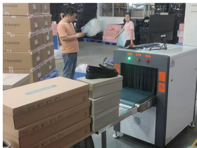
客户现场 customer site