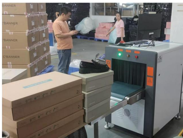
客户现场 customer site