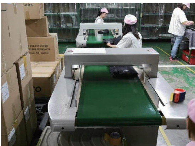
输送式检针机 Conveyor type

The conveyor needle detector can quickly and accurately detect hidden ferromagnetic metals in clothing, toys, and other products. If a broken needle is detected, it will sound an alarm and stop or return the machine. It has the characteristics of anti-interference and high stability. The non transmission needle inspection machine is suitable for wide width fabrics such as non-woven fabrics, spray bonded cotton, bed sheets, carpets, etc. If ferromagnetic metal foreign objects are detected, the machine will sound an alarm and shut down.